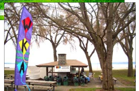
“Home Sweet Home” at the park.