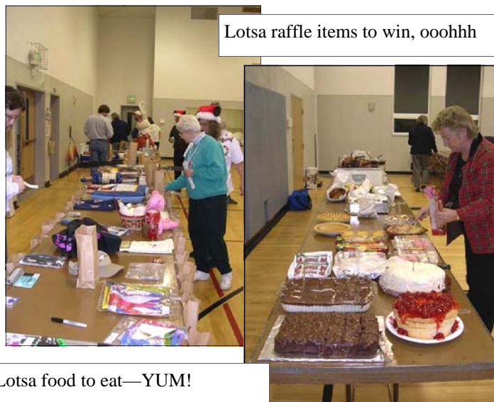
Lotsa raffle items to win, ooohhh