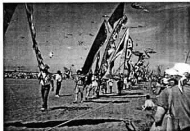
Another shot of the banner parade