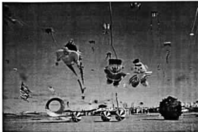
Flowforms, the Genie from Alladin and Bert & Ernie, brought to WSIKF by Team No Limit from Germany add color to the sky.