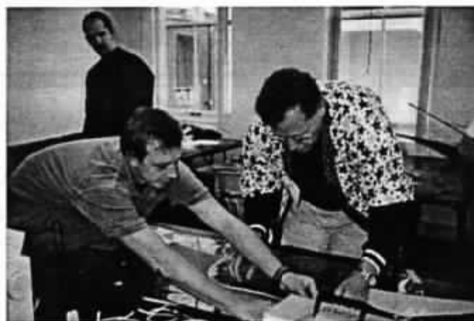
Sticking Mini Midi to the template