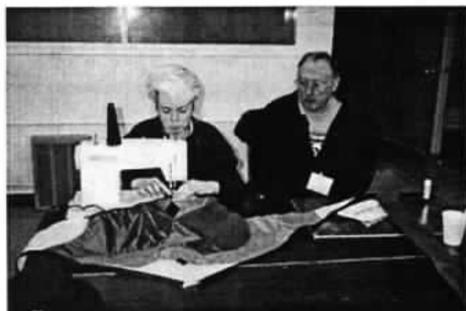
Mini Midi in progress