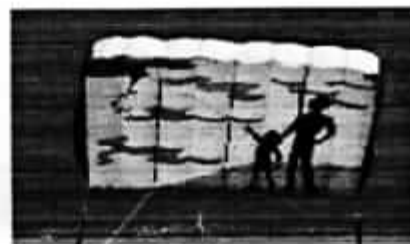
The "Tom" parafoil

Another Spaghetti Feed is under our belts (pun intended). We exceeded all other years in the number of people fed and funds raised. Over 220 people attended the event and contributed $3,827.75 for dinner, raffle, auction and pins. Our costs were $1,497.41 for a net of $2,760.34. This was an increase of over $700 from the previous year. This is our one and only fundraiser during the year and it will help carry us through for another year.