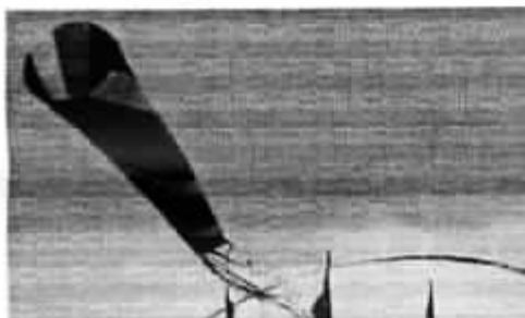
A little morning fly before everyone arrived.