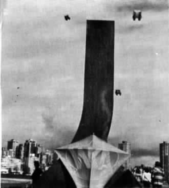
The WKA Kite at the 6th Annual Pacific Rim Kitefest