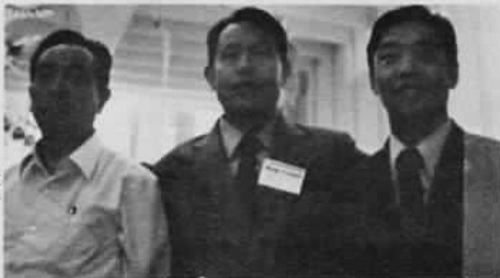
Kitemaster Ha with fliers from Weifang