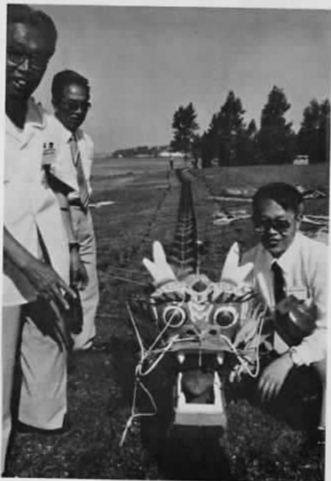
Weifang centipede kite