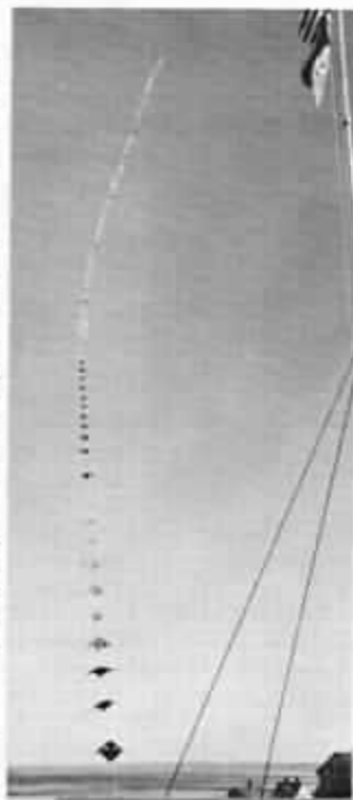
Van Gilder's delta train