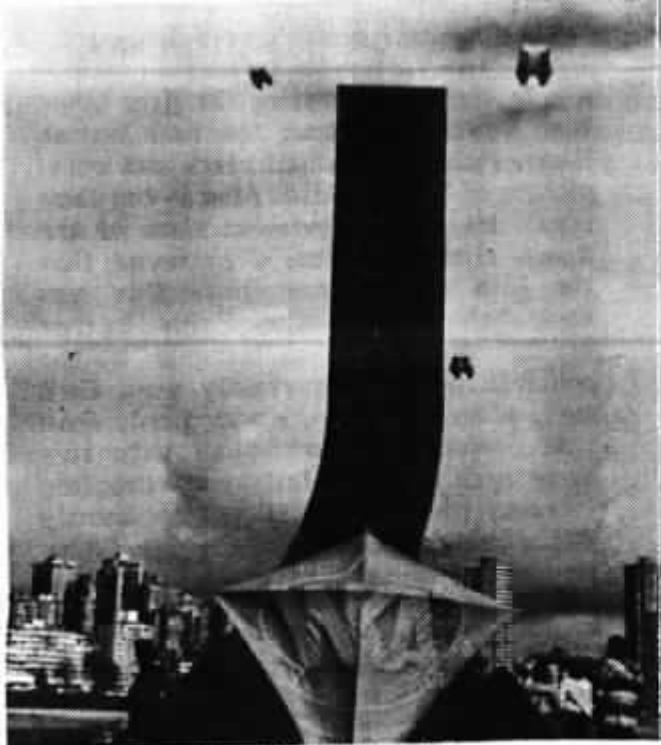
The WKA Kite at the 6th Annual Pacific Rim Kitefest